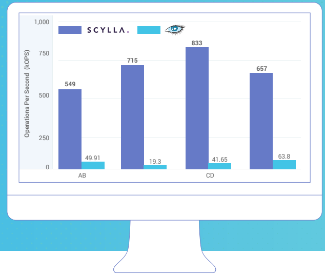
Samsung Benchmark shows throughput of Scylla vs Cassandra using 2TB of data for different YCSB workloads

Scylla goes beyond the usual tradeoffs to deliver scale-up performance of 1,000,000 IOPS per node, and scale-out capacity to hundreds of nodes with 99% latency under 1 millisecond.